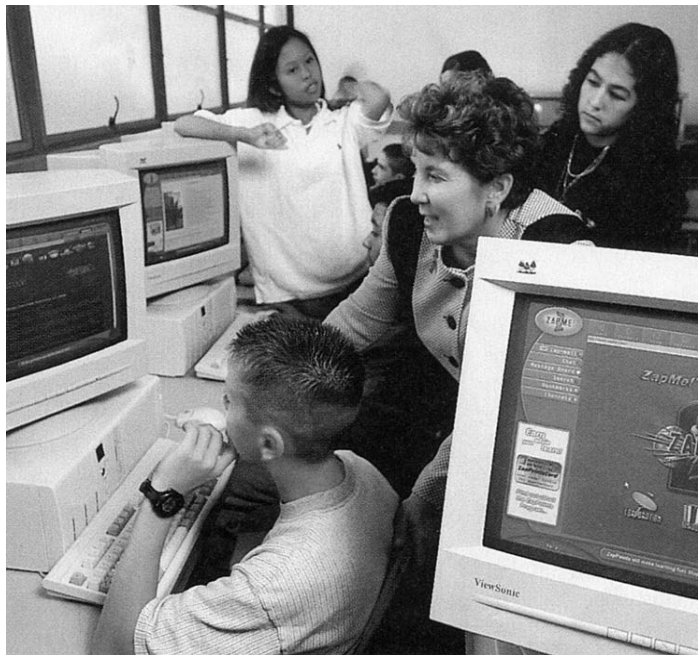
Screening room: Students using computers from ZapMe at a high school in California

ZapMe, which was officially launched last month, has put new PCs into about 70 schools and plans to be in 200 by the end of the year. But the computers can be used only with the ZapMe Netspace, a