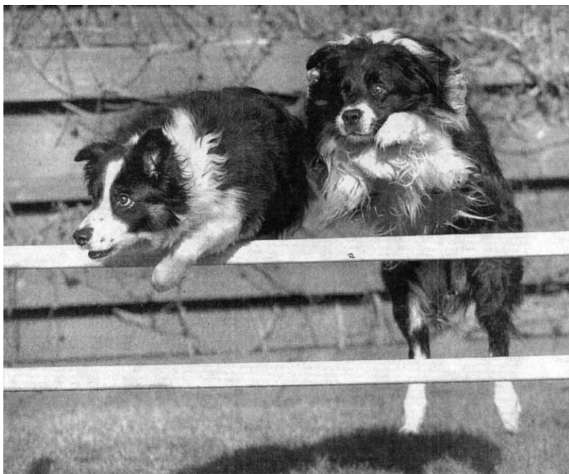
One jump ahead: a new company is offering breaks with a difference for canines in Scotland